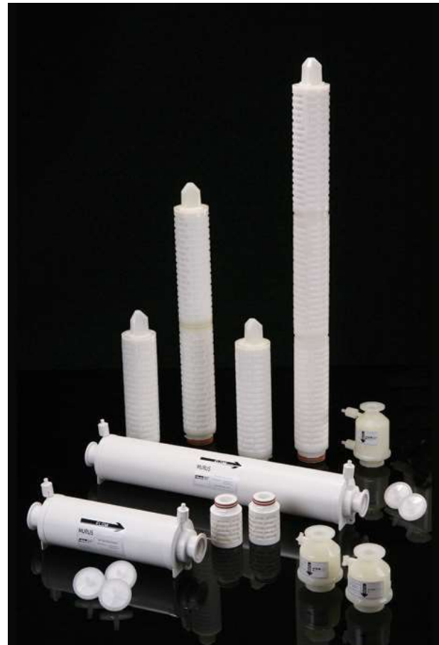
Note: TETPOR is a registered trademark of Parker Hannifin Corporation.